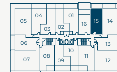
BUILDING 1 LEVEL 4-6