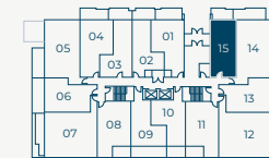
BUILDING 1 LEVEL 3