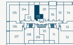
BUILDING 1 LEVEL 4-6