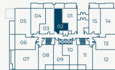
BUILDING 1 LEVEL 3