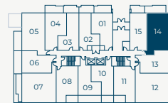
BUILDING 1 LEVEL 3