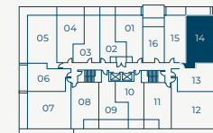
BUILDING 1 LEVEL 4-6